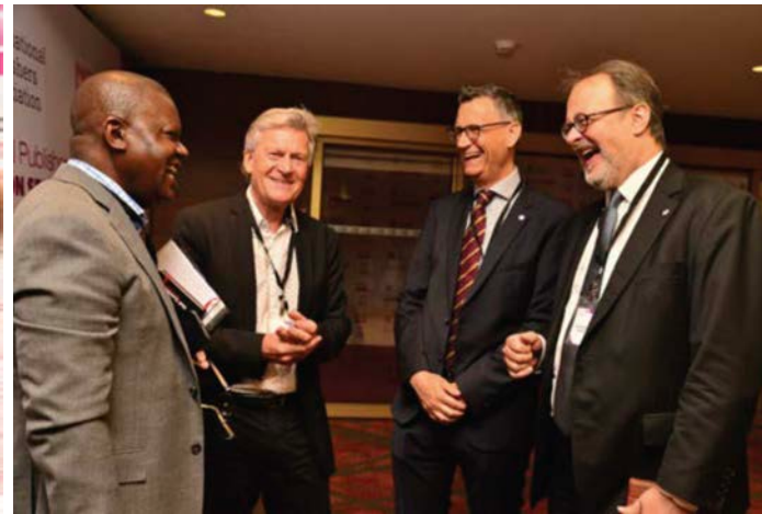
Guests networking at the welcome reception.