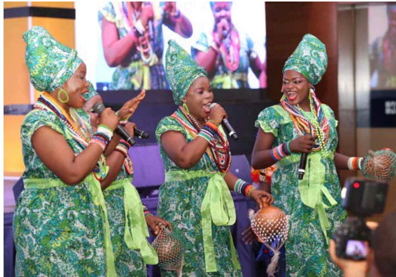
Adunni & Nefertiti Band performing during the gala dinner.

The Seminar ended with African singing, drumming and dancing, courtesy of Nigerian vocal and dance troupe Adunni & Nefertiti who describe themselves as folksong ambassadors, keeping alive music that appeals across language and ethnic barriers. They gathered various members of the audience to join in the dancing which made for a joyous end to a stimulating day.