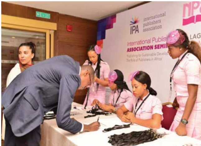
Guest registration desk.

The inaugural International Publishers Association (IPA) Africa Seminar, entitled 'Publishing for Sustainable Development – The Role of Publishers in Africa' – was jointly organised by the IPA and the Nigerian Publishers Association (NPA), and held at the sumptuous Eko Hotel and Suites in Lagos, Nigeria on 9 May, 2018.