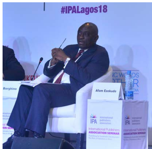
Panel Discussion - 6, speakers Afam Ezekude , Director General, Nigeria Copyright Commission discusses government intervention on piracy.

He said that between 30 and 50% of books used in secondary schools are pirated and he asked three questions: Are the legal provisions against piracy adequate? Are booksellers themselves ethical? How can the industry protect itself against pirated books coming from outside the country?